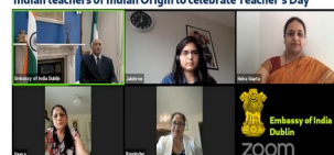
Ambassador in panel discussion with Indian teachers – panelists

3. Interaction with Indian students: As part of Embassy's orientation programmes for new students, Ambassador and the Embassy officers interacted with incoming students of University College Dublin (24 Sep). Students were briefed about the living conditions in Ireland, the post-studies career opportunities, and specific health and security precautions required to be undertaken during their stay in Ireland. They were assured of all necessary assistance from Embassy, as required.