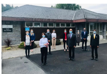
Ambassador with Ennis Day Hospital staff in Co. Clare