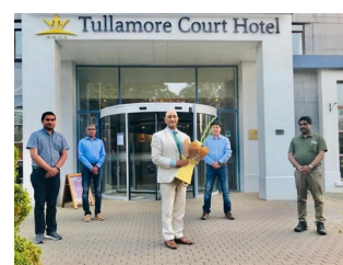
Ambassador with Tullamore Indian Association representatives